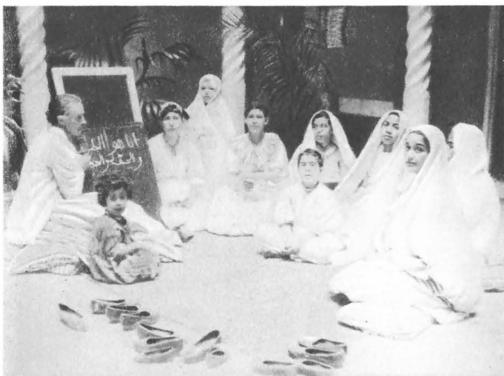
LILIAS TROTTER, WITH HER CLASS AT RUE DU CROISSANT, 1899.