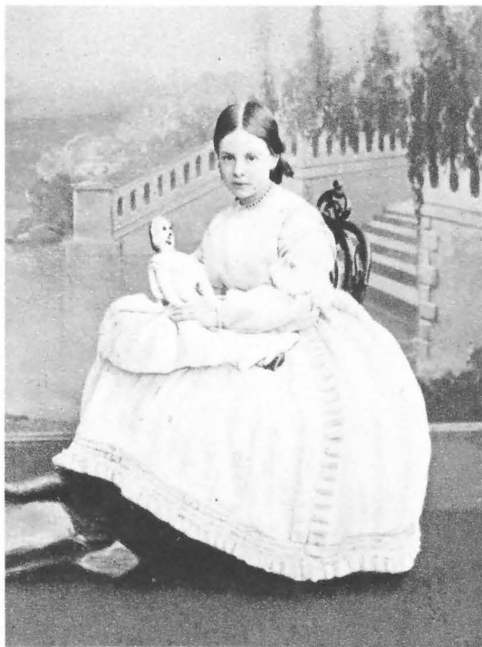
LILIAS TROTTER AT THE AGE OF 10.