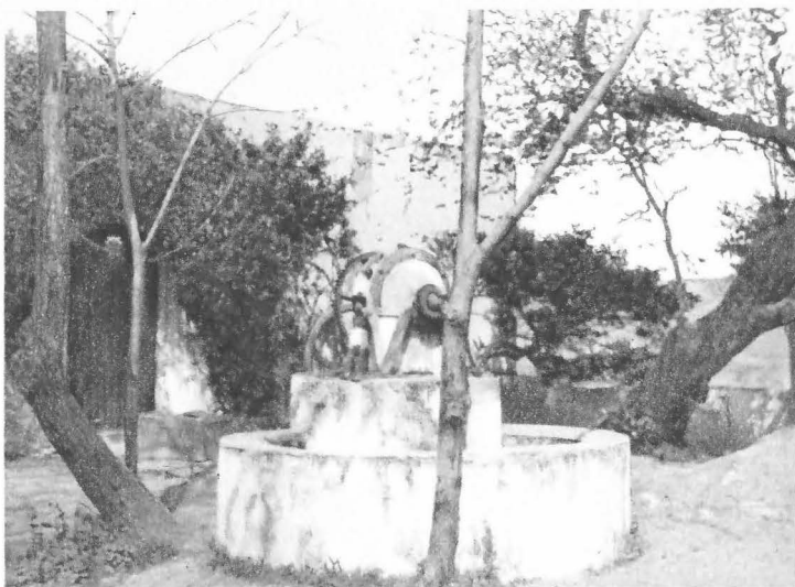
A WELL AT DAR NAAMA.