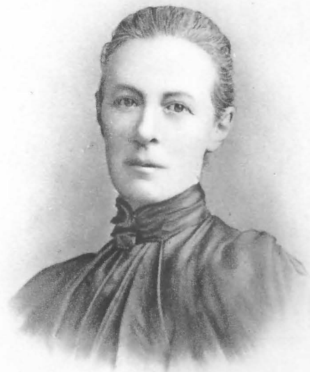
LILIAS TROTTER AT 35.