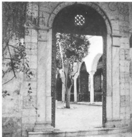
ORANGE COURT, DAR NAAMA and ENTRANCE HALL, RUE DU CROISSANT.