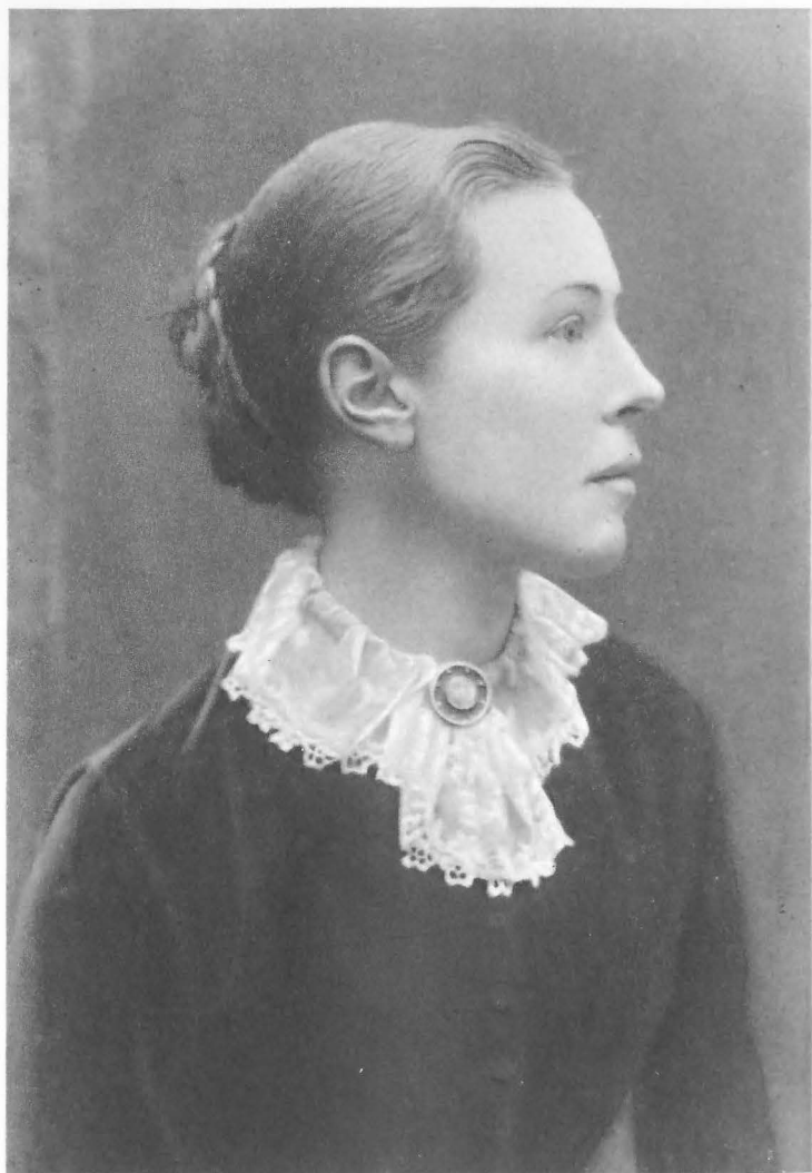
LILLAS TROTTER AT 27.